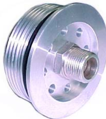
MB Smart Car Spin-on Conversion

Canister type oil filters predate spin-on filters and are still commonly used today. Both types of filters are effective; however, spin-on filters are less expensive and easier to service, making them considerably more popular. Unless factory equipped, canister filter engines generally can't be equipped for oil cooling; this is likely the main reason to convert, as most aftermarket components are only designed for spin-on filters. We offer a selection of well engineered conversion kits for many vintage and modern vehicle applications.